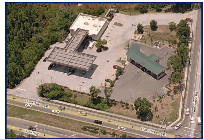
Below: View to South

PHONE: 727-536-8686 • FAX: 727-536-4356 • Belleair Development Group